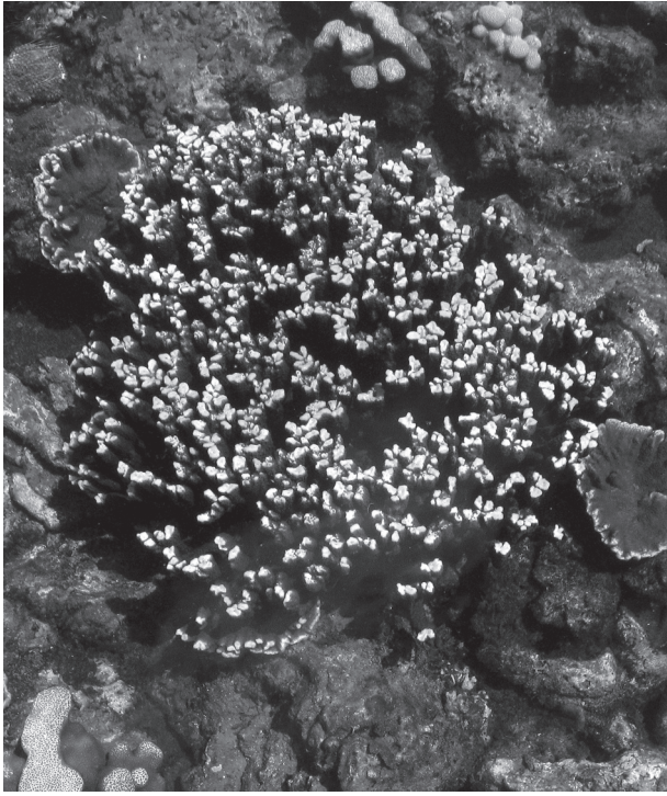
Figure left: Colony of Montipora dilatata